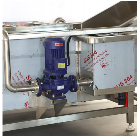
Water Pump & Filtration Tank