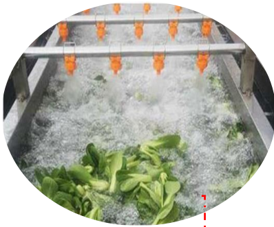
High pressure spray nozzles