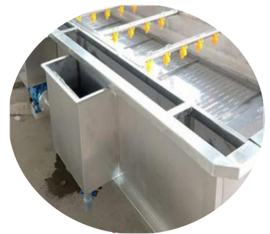
SUS 304 stainless steel machine body